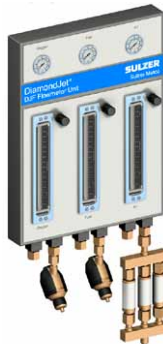
DFJ Gas Flowmeter

When used as part of a complete manual Diamond Jet HVOF spray system, the DJF will provide precision control, while providing a simple means of maintaining the accuracy required. The unit incorporates easy to read flowmeters and pressure gauges for pre-setting and monitoring process gas parameters.